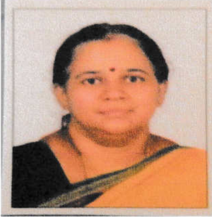
Photo of the resource person