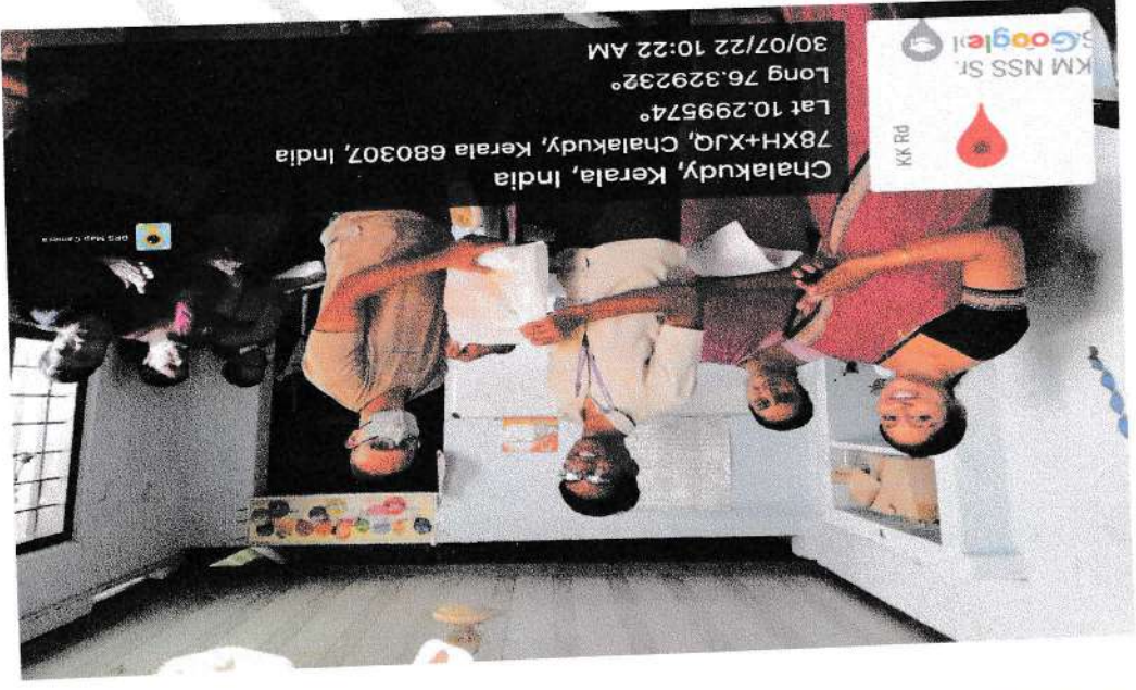
Naipunnnya Institute of Management and Information Technology