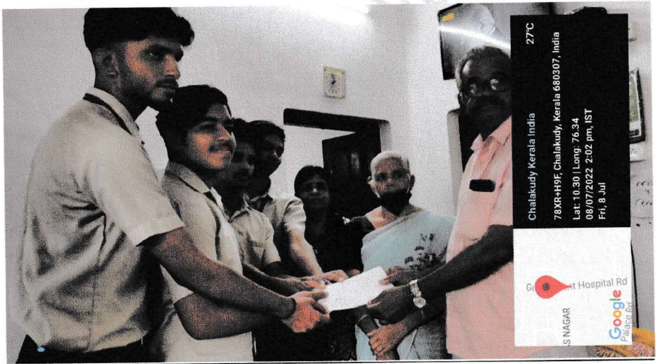
4 Outreach activity