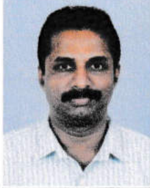
Photo of the resource person