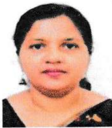
Photo of the resource person