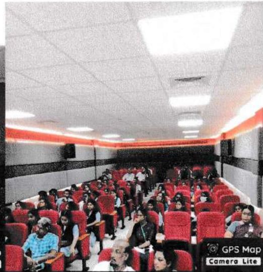
69WF+P84, Naipunnya Nagar, Karukutty, Kerala 680308, India