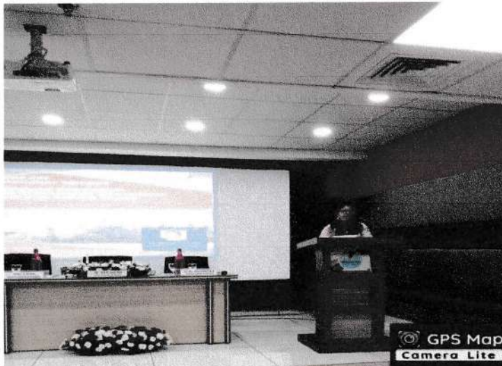
69WF+P84, Naipunnya Nagar, Karukutty, Kerala 680308, India