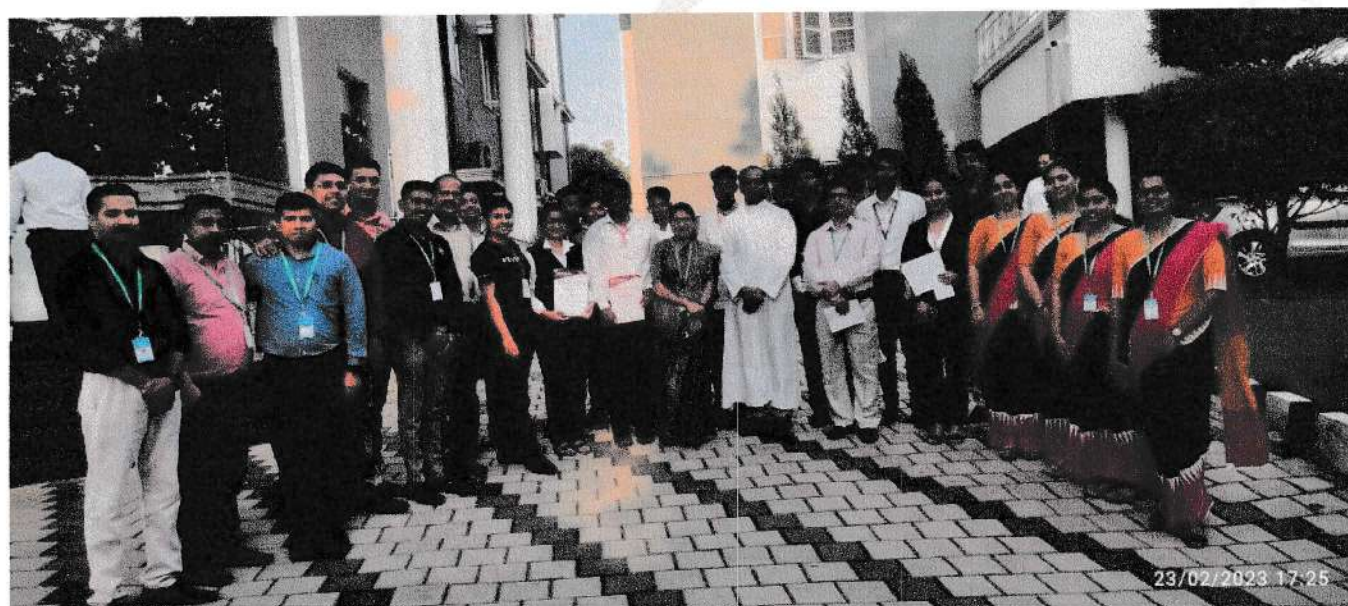
Group photo with participants and their faculties