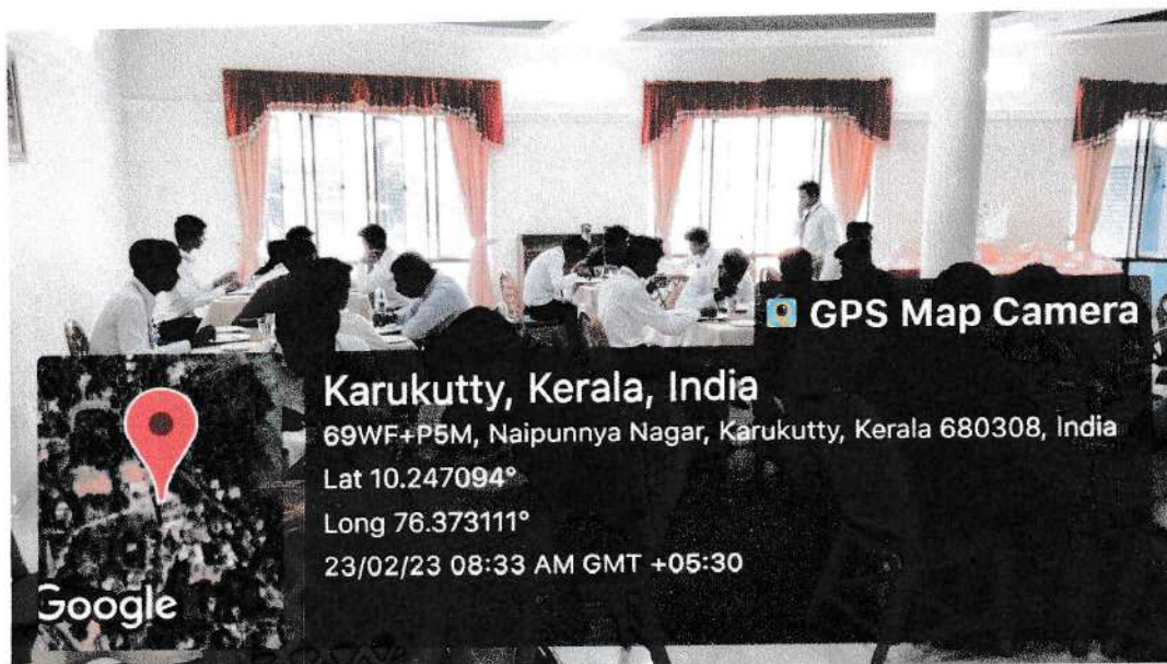
Food served for participants and their faculties